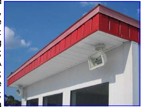
New vinyl pilot house fascia & soffit

After the Radical Boat Reunion and over the next few weeks, the work crew, now reduced to Bob Trail and Steve Huntley, with occasional help from others: (9) completed the vinyl covering installation around the upper deck fascia; (10) replaced the starboard PALATKA YACHT CLUB sign, a major job in itself; (11) replaced some rotted wood at the forward end of the pilot house roof; (12) fitted a new red-painted vinyl fascia around three sides of the pilot house roof