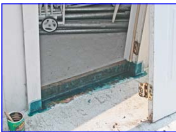
New pilot house door threshold

(4) Gene Roberds installed and glassed in a 4-inch-high threshold at the pilot house door and replaced some lower rotted sections of the door frame, to prevent cloudburst-type rainwater intrusion through the entryway. That stopped rainwater from entering the pilot house in that area, but it still came in elsewhere, where the caulking had failed around the deck seal at the pilot house base, and ants were seen going in and out. On Friday, the last day before the expected big event, the crew (5) worked on our landlord Ron's dock, in anticipation of some Radical Boat people docking there; (6) cleaned up the clubhouse; (7) put the big freshly-scrubbed PALATKA YACHT CLUB sign back upon the port (river) side over the new fascia; and (8) put away all tools, ladders, etc., in preparation for serving our lunch guests the next day.