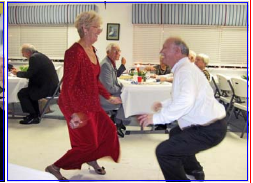
Come on - Let's do the Twist!!