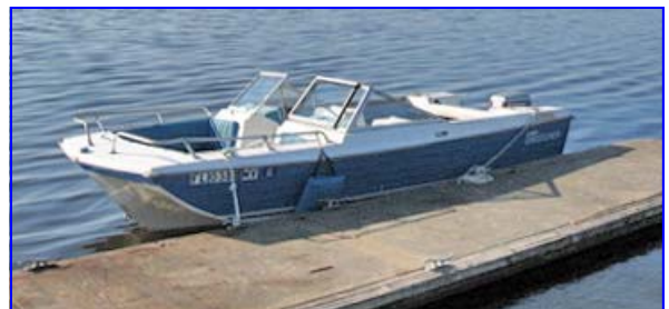
The Trails' Crestliner motorboat