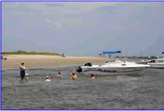
Cooling off at Cumberland Island

We headed back south again, passing Kings Bay. Up ahead we spotted one of the tugs that we'd seen earlier in the morning. The excitement level increased on all the boats to no avail, as there was no submarine. Then the second tug returned to port, still with no signs of the submarine. Due to the sun and the increased excitement level, we had to go swimming again, so we anchored up on the sand beach on Cumberland close to where we were earlier in the day. Lana and Jeannine searched the beach for treasures such as shells and abandoned anchors.