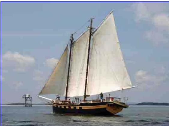
Schooner in inlet at Ft. Clinch