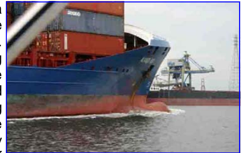
Passing containerships underway

navigated across a sandbar in front of a small creek on the southwest end of the island that headed up through the marsh to Dungeness, the ruin managed by the National Park Service. Knowing that the tide was coming in, Captain Girardin had no fear of running aground until we approached the bluff where the residences are, and the water got real skinny. The wake from the boat as he came off a plane forced water ahead of us and stirred up all kinds of bait. The water was just hopping with critters, including shrimp, one of which was found the next day on the boat as we pulled it out of the water at home. The mud flats were shimmering with thousands of fiddler crabs out for a meal. We didn't get as close to the shore as we had hoped, however, the trip was deemed successful. All in all, Gator Bait went 50 statute miles on Saturday.