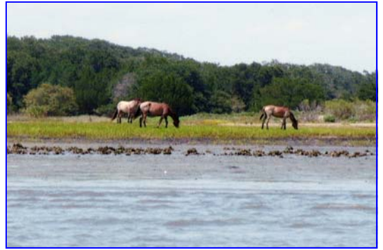
Wild horses on Cumberland Island

We headed back south again, passing Kings Bay. Up ahead we spotted one of the tugs that we'd seen earlier in the morning. The excitement level increased on all the boats to no avail, as there was no submarine. Then the second tug returned to port, still with no signs of the submarine. Due to the sun and the increased excitement level, we had to go swimming again, so we anchored up on the sand beach on Cumberland close to where we were earlier in the day. Lana and Jeannine searched the beach for treasures such as shells and abandoned anchors.